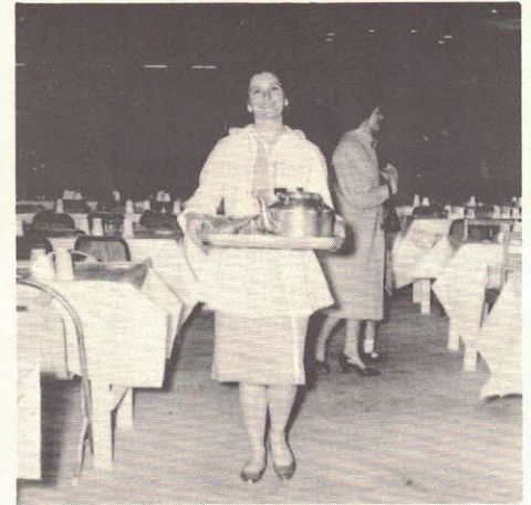
FUN SHOW. . .

At eleven o'clock that night when the final dance was over, it was evident from the happy, smiling faces and the genuine feeling of friendly warmth of the brethren one for another, that they had enjoyed a happy and profitable evening.