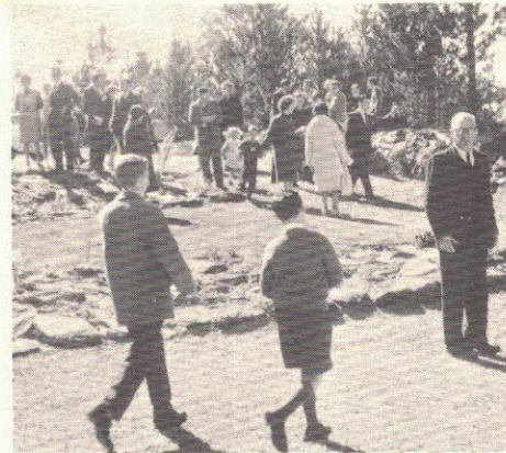
GET ACQUAINTED DANCE. . .

Much could be said of these important doctrines of God's Church as they directly tie in with the meaning and purpose of the Festivals. But it is certain that the attitude and lives of God's own begotten children show forth, in a way words cannot, the meaning and significance of being properly baptised and receiving the very spirit, mind and attitude of Almighty God, eternal life abiding in us. Pray earnestly for the 48 new brethren of yours upon whom judgment now rests.